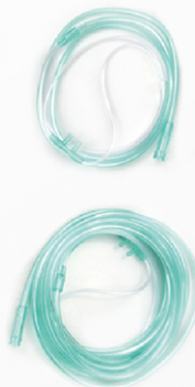
Nasal oxygen canula